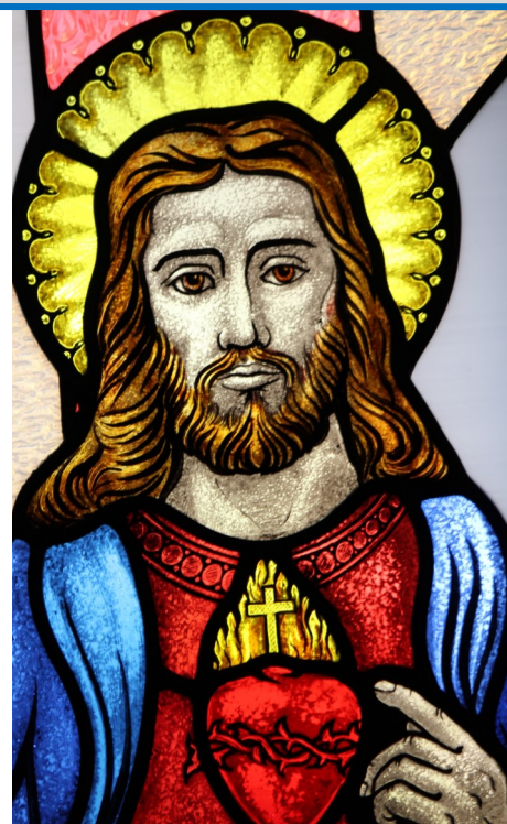
Photo Insert: Stained glass window of the Sacred Heart of Jesus, located inside the St Maria Goretti chapel within St Anthony's church at Edwardstown, South Australia.

First Friday of the month after 9:30am Holy Mass. This is followed by Holy Communion to the sick and housebound by the Priest.