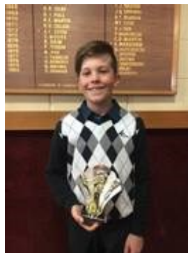
Pt Augusta Jnr Open